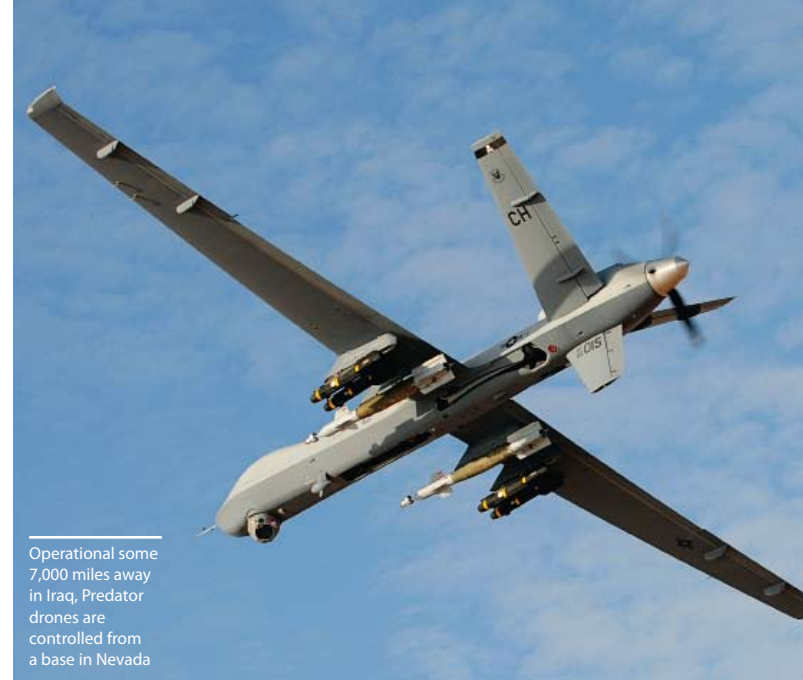
Operational some 7,000 miles away in Iraq, Predator drones are controlled from a base in Nevada

Today, countries like the US and UK are leaders in the military robotics field, but there are over 40 other countries also