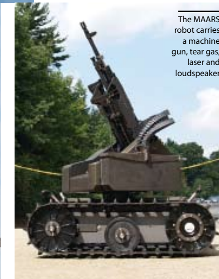
The MAARS robot carries a machine gun, tear gas, laser and loudspeaker

building and using military robots, ranging from China and Russia to Pakistan and Iran. But the use of unmanned systems is by no means limited merely to state powers. Just as the software industry has gone 'open source', so has warfare. That is, just as software programming is no longer limited to a few behemoth companies, but also kids in their basements, non-state actors can also build, buy and use the most sophisticated weapons systems. So far, these non-state actors who have entered the realm of unmanned war have ranged from a group of students at Swartmore College in Pennsylvania, who negotiated with private military firms to rent drones to deploy against the genocide in Darfur, to the Hezbollah militant group, which flew at least four drones against Israel during their recent conflict.