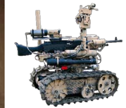
[ SWORDS ]

A modern day spy plane toting a camera with a lens that can penetrate sandstorms and thick clouds to provide a hi-res overview of the carnage a platoon may have just caused below. Impressively, it can also cover 100,000km 2 of terrain each day. But its downfall? Each one costs a whopping $35 million to make.