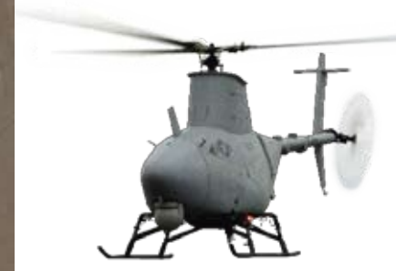
[ Fire Scout ]

Seven metres long, three metres high and the unmanned jewel in the crown of the US Navy. It not only provides the military with reconnaissance reports, but can also spot enemies from up to 172 miles away while hovering 20,000 feet in the air. And when it spots the baddies? Out come its laser-targeting 'fire-and-forget' missiles.