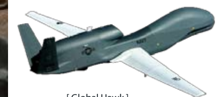
[ Global Hawk ]

Seven metres long, three metres high and the unmanned jewel in the crown of the US Navy. It not only provides the military with reconnaissance reports, but can also spot enemies from up to 172 miles away while hovering 20,000 feet in the air. And when it spots the baddies? Out come its laser-targeting 'fire-and-forget' missiles.