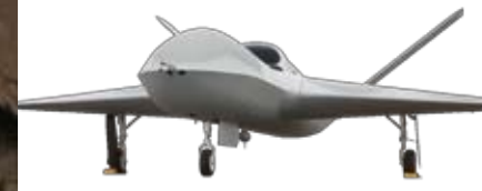
[ General Atomics Avenger ]

Tipping the scales at a mere seven stone, this is able to carry a number of deployable weapons – from an M16 rifle to a six-barreled grenade launcher – its use on the Iraqi battlefield in 2007 represented the first time a US military robot had carried its own weapons into war.